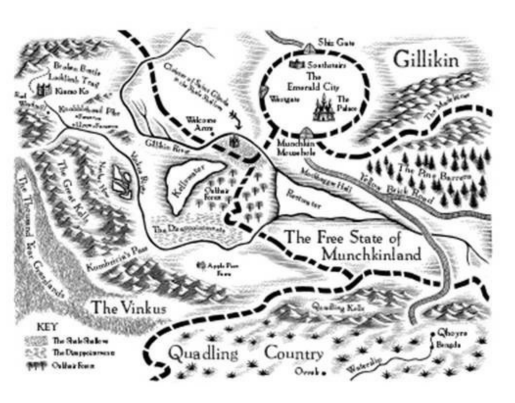
The Eye of the Witch